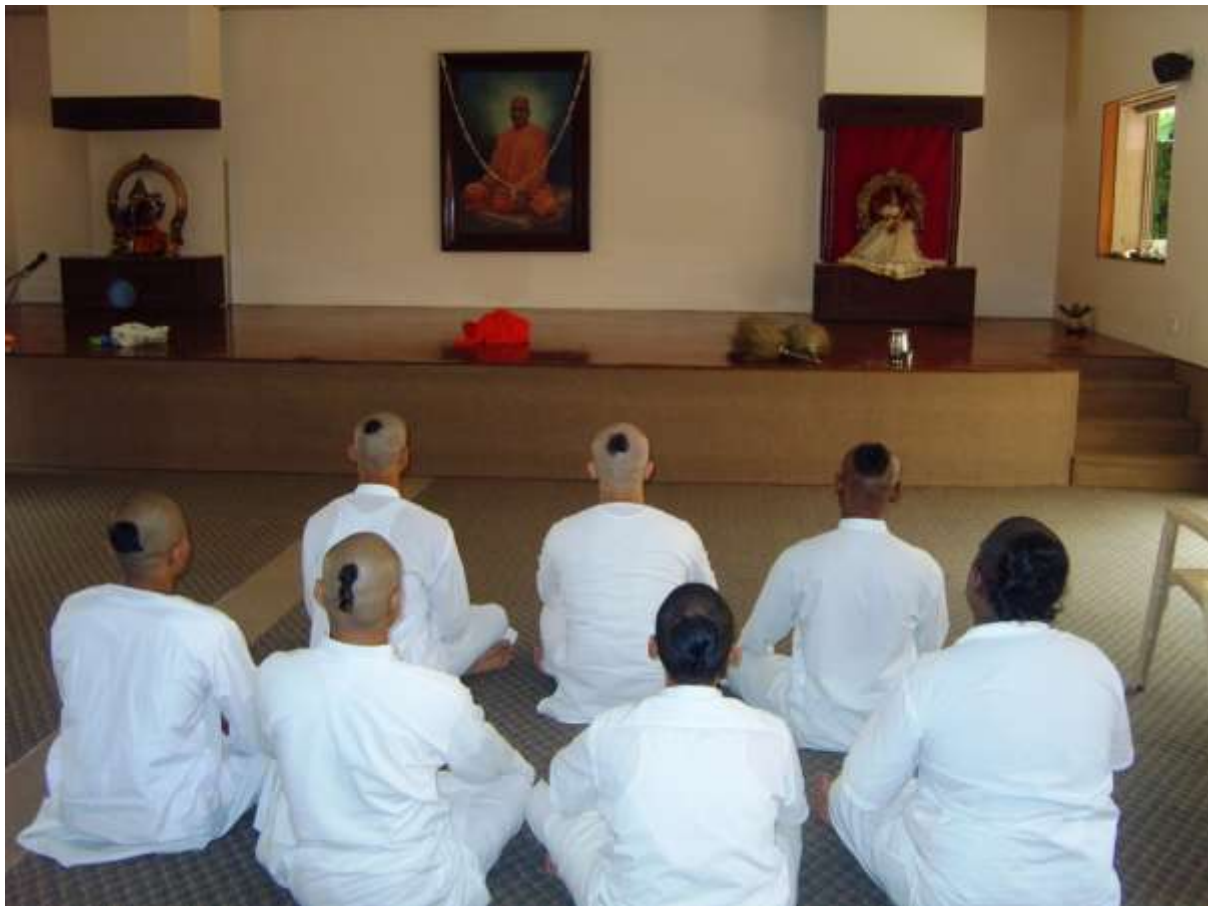
Students ready for Sravana or hearing the Knowledge, with their Mundan (head-shaving ceremony) performed and Shikha (tuft) uncut, symbolizing their sole desire for knowledge of Truth.